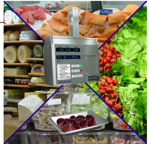
Ideal in seafood, produce, bulk foods, candy, cheese, and service meat departments.

The thermal label printer features a large label capacity and high definition print head. You can print more