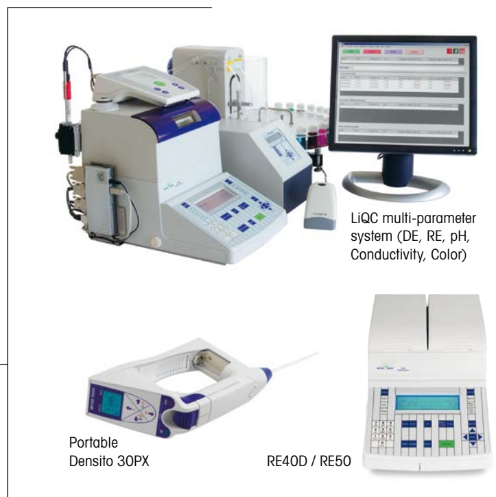
LIQC multi-parameter system (DE, RE, pH, Conductivity, Color)

METTLER TOLEDO has a complete range of portable and bench-top instruments for density and refractive index determinations. Instruments are available in different configurations, ranging from simple, cost-effective, stand alone equipment to complete measuring solutions for automatic multi-parameter analysis.