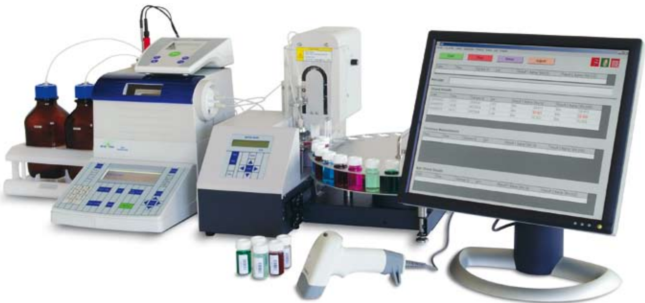
LiQC Multi-Device system with DR45 Combined Meter, SC30 automation unit, SevenEasy™ pH meter and barcode reader Heron-G D130