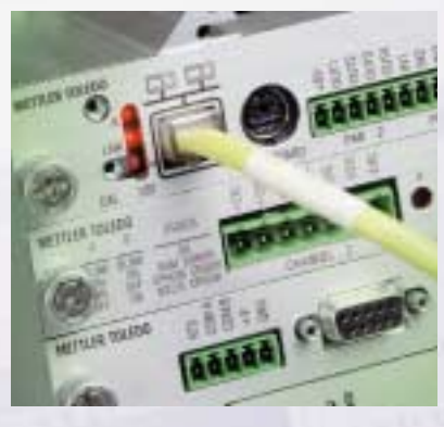
The JAGXTREME terminal's TraxEMT™ lowers the cost of ownership by embedding a virtual METTLER TOLEDO technician into every JAGXTREME terminal.

It is the first industrial weighing solution to integrate information, equipment life cycle management, and automation control into the manufacturing enterprise — and the only one that enables you to weigh fast, weigh powerful, and weigh cool.