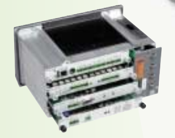
The JAGXTREME terminal is configurable to provide high functionality at an economical value.